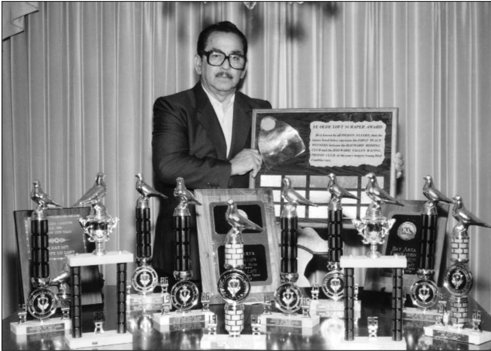
The author with awards won in 1986—his best year ever.